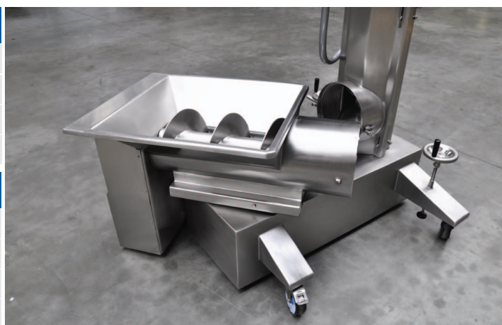
Detail of rotating horizontal part